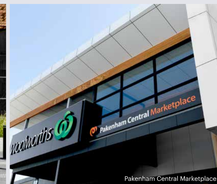
Pakenham Central Marketplace