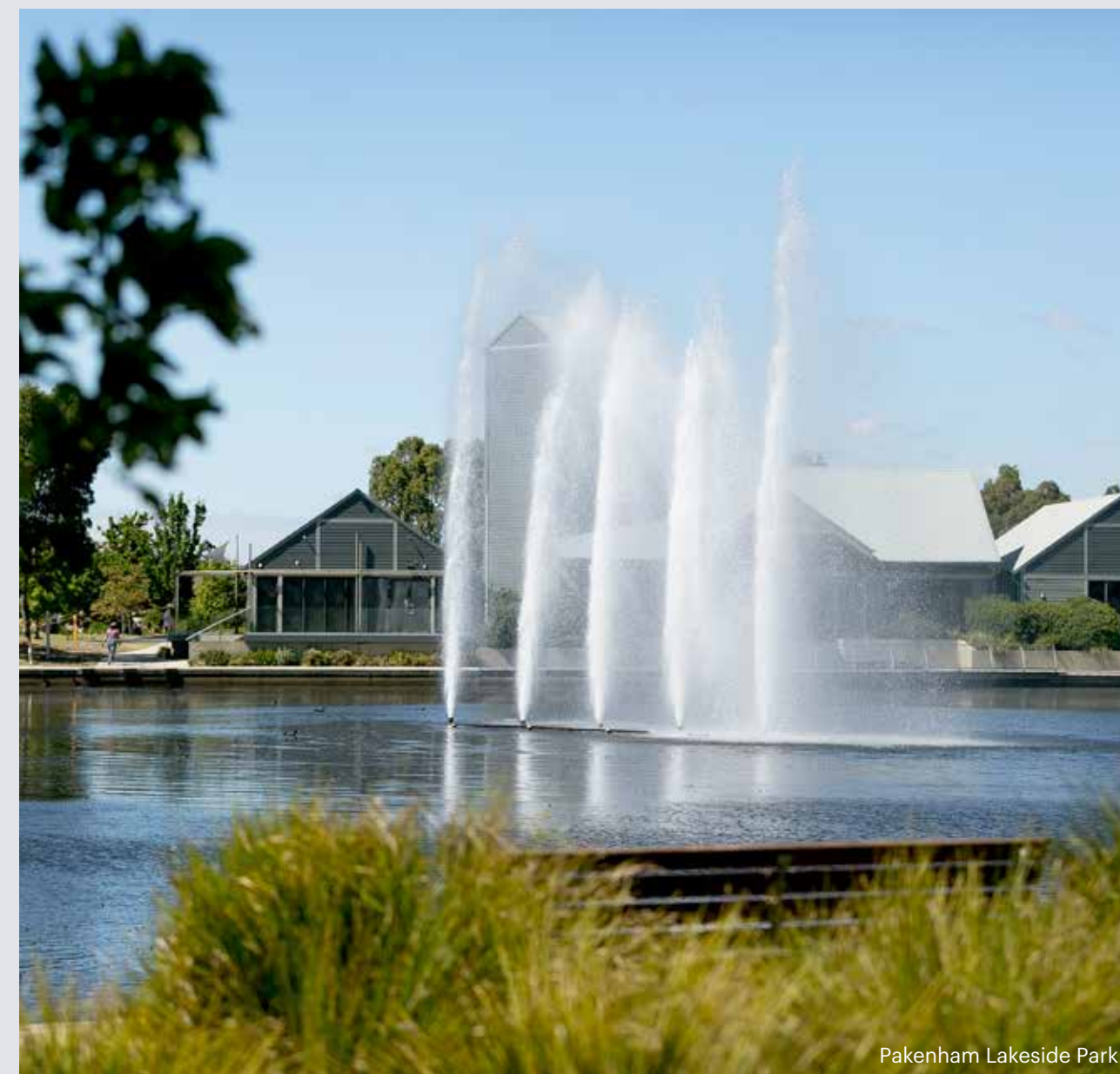
Pakenham Lakeside Park

With the train station nearby, the heart of Melbourne's CBD is just a train ride away.